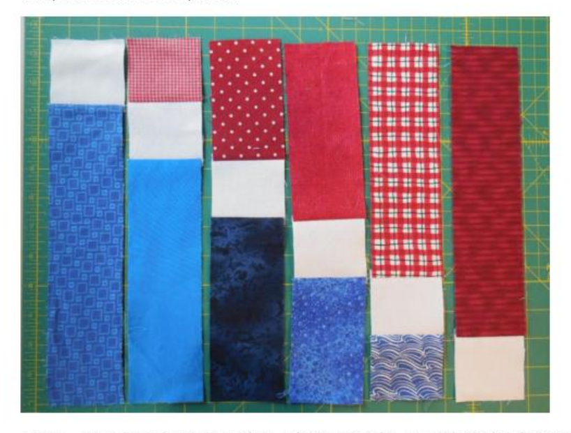
Step 2 – Sew the columns together. It's that simple. Your block should measure 12-1/2 x 12-1/2 inches.